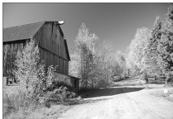
Eustis road by Benoit Leclerc.

Your photo might appear in the next municipal calendar!