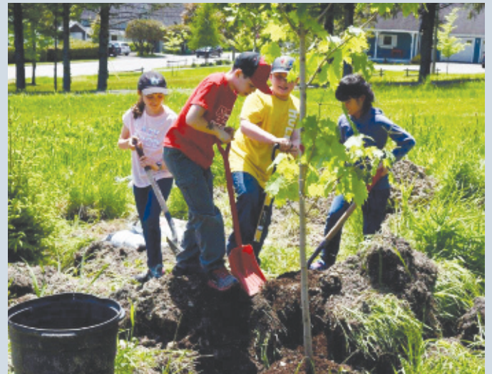
Children from North Hatley Elementary school

Joined by many guests such as Mayors, councillors and other participants, more than fifty children from the North Hatley Elementary School planted 100 trees and shrubs at Scowen Park on June 5, creating a beautiful arborway to the celebrated trail on Capelton Road.