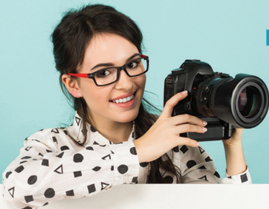
PHOTO SEARCH FOR THE 2023 CALENDAR

Spring is arriving very fast et we already are thinking about our summer activities. To encourage our local businesses and enterprises, don't hesitate to consult our internet site to discover the inns, restaurants and the food industry. You will be pleasantly surprised by the resources that exist in the Canton. Have a great Spring! cantondehatley.ca/en/information/businesses/