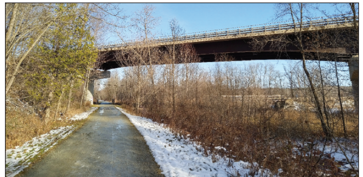
The Herring Bridge, seen from the bike path. Geographical location: 45°20'58.4"N 71°51'50.6"W (45.349561, -71.864061)