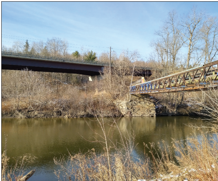
The Morrisette Bridge on the stone abutments of the old covered bridge and the Herring Bridge. The Morrisette Bridge is used for the region's snowmobile network.

The 1938 bridge (Comstock/Hearing/Herring) was demolished during the winter of 2011-2012. The municipal council of Sherbrooke, at its meeting of September 6, 2011, suggested to the Commission de toponymie du Québec to keep the name Herring for the new bridge which had just been built.