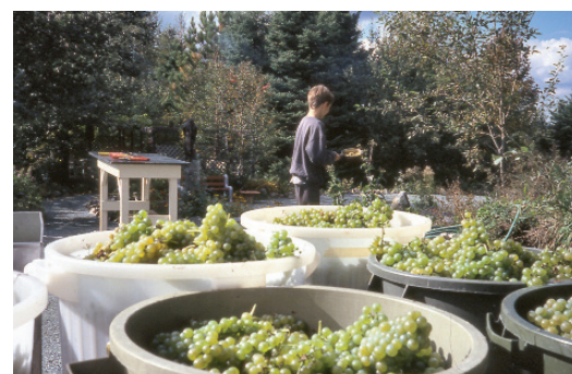
Seyval harvest at the Sous les Charmilles vineyard in 1995